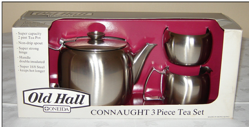
Above: Note MADE IN HONG KONG bottom right!

After Old Hall had closed down in 1984, Oneida brought out a very limited range of Old Hall made in the Far East, based largely around the Connaught tea set; such items are back-stamped Old Hall FOREIGN rather than Old Hall MADE IN ENGLAND.