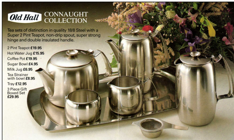
Above: The Oneida Connaught Collection, February 1987

After Old Hall had closed down in 1984, Oneida brought out a very limited range of Old Hall made in the Far East, based largely around the Connaught tea set; such items are back-stamped Old Hall FOREIGN rather than Old Hall MADE IN ENGLAND.